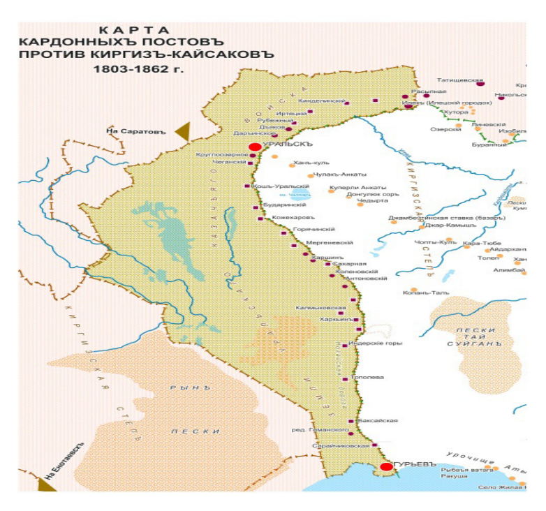
Figure 2 – Scheme of the author on the materials of Kazrestavratsiya

2. The development of the linear settlement of urban settlements along the Ural River (Zhayik) is dictated mainly by the development of the Ural River, rich in valuable fish, and by the displacement of nomadic tribes to the southern steppe territory by building fortresses and fortresses (Smirnov, Kobdabaev, 2017) necessary to protect the southern borders of the Russian Empire . The lower course of the Ural River is a kind of core of life for the West Kazakhstan and Atyrauregions of Kazakhstan against the background of the desert and semi-desert (Chibiley, 1988). It was at this time that such fortified cities as Orenburg, Orsk, Iletskaya Fortress (on the territory of Russia), YaitskiyGorodok (Uralsk), Guryev-gorodok (Atyrau), Aktyubinsk (Aktobe), and already by the 18th century were laid as military engineers in the expedition they become the main strongholds of the Urals defense system, the most powerful consolidation of their time. An important role was played by the distance from one fortress to another in the event of raids or sieges of timely military assistance. For the most effective control over the boundless steppes and rapid reaction to the raids of the Kokand, Turkmen, etc., expeditionary and military detachments were built fortresses and fortresses Karabutak, Irgiz (Ukr. Ural), Turgai (Ukr. Orburgskaya), Fort Raim (Kazalinsk) etc. The development of trade relations in the western regions of the Tsarist Empire with nomadic peoples forced