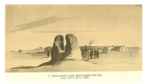
Figure – Strengthening of Irgiz. Strengthening of "Karabutak" Fort "Raim" (Kazalinsk) (Picture of T. Shevchenko)