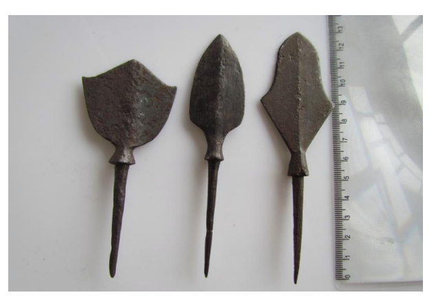
Arrowheads of the Yenisei Kyrgyz