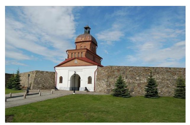
The fortress of Kuznetsk (XVIIth c.)

In May 1667, Erenak bek, along with the dzungars, makes a march to Krasnoyarsk (Kyzyl-Jar). Russian military governors knew about the preparations for the campaign and prepared for the defense. On May 13, the siege of the city began. Krasnoyarsk lost 125 people from the garrison, 48 volunteers, 17 suburban Tatars and nine people