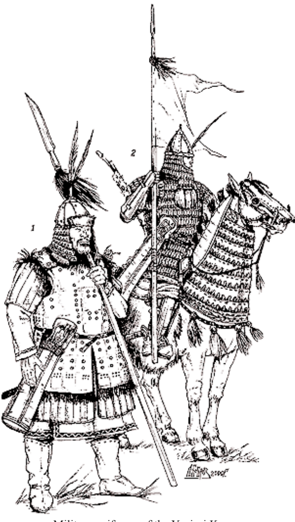
Military uniforms of the Yenisei Kyrgyz in the 9th-17th centuries.